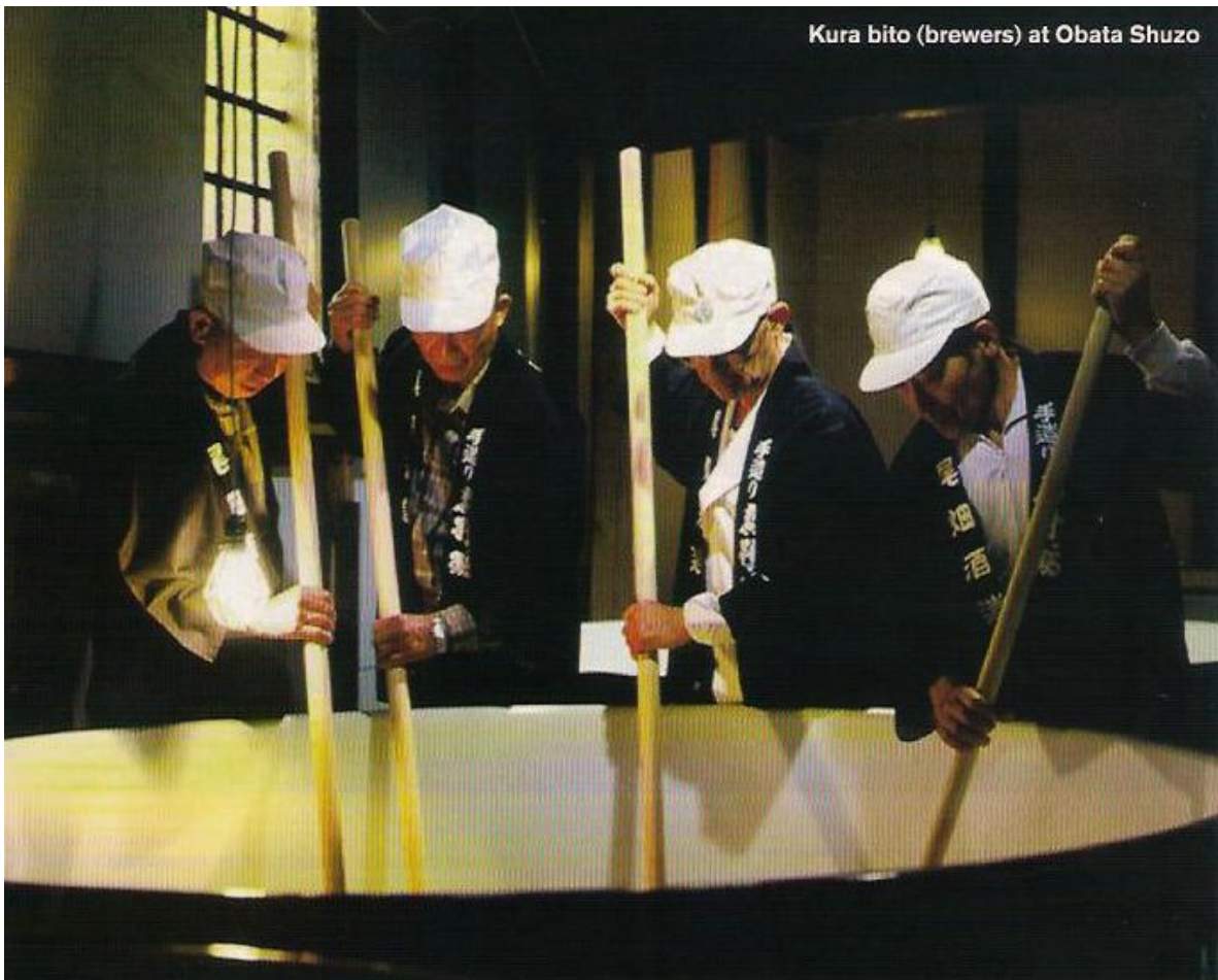
Kura bito (brewers) at Obata Shuzo