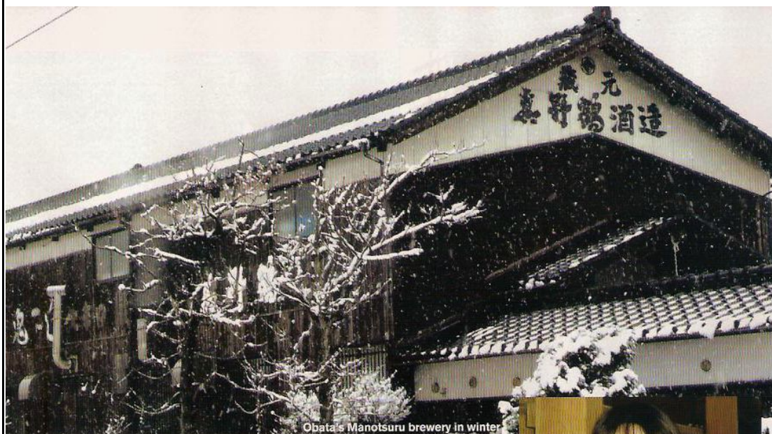
Obata's Manotsuru brewery in winter